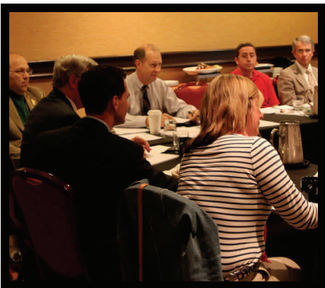
Board at work